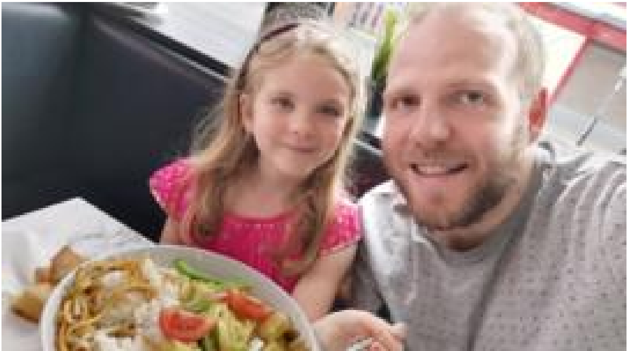
'I saved £200 doing Eat Out to Help Out every day'