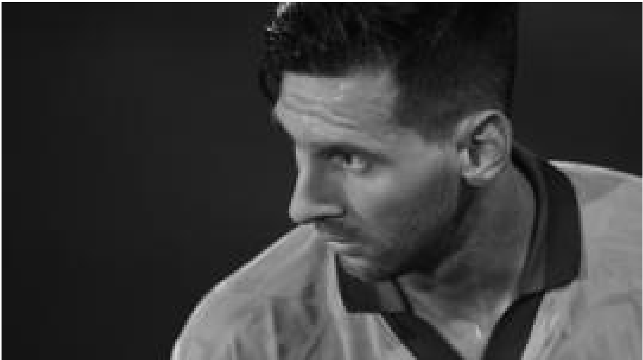
Where could Messi go if he leaves Barca?