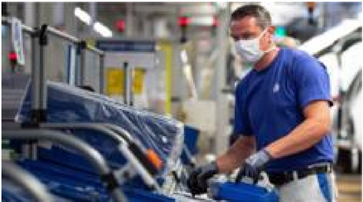
Germany extends coronavirus pay top-up scheme