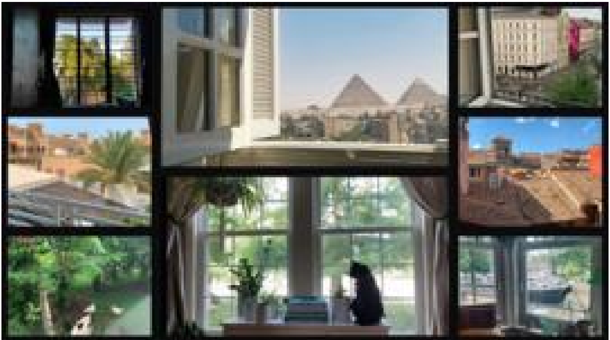
'There's no such thing as a bad view'