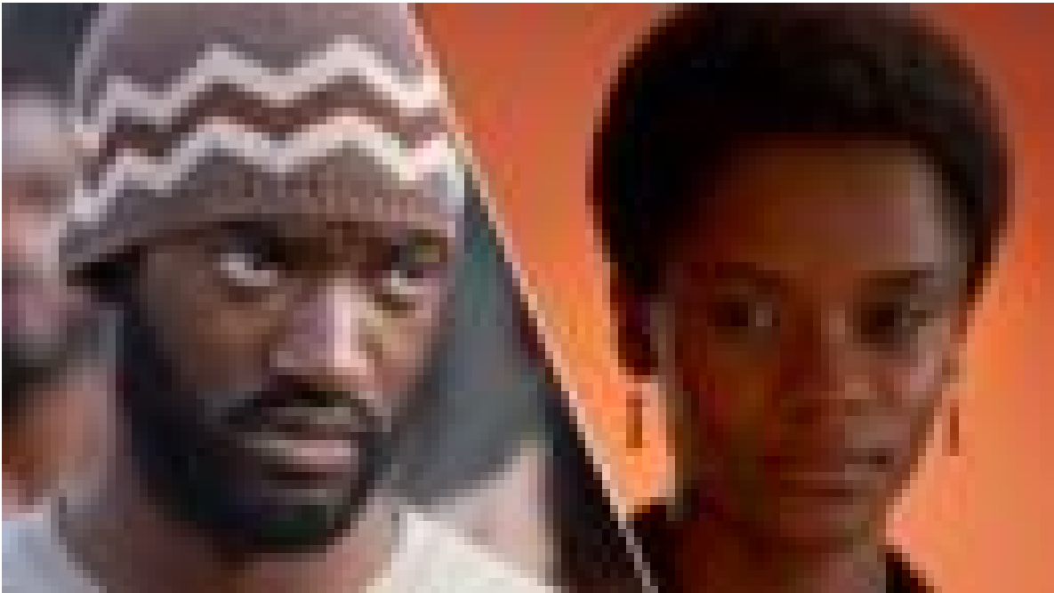
From Academy Award winner Steve McQueen

Small Axe: Five must-see personal stories