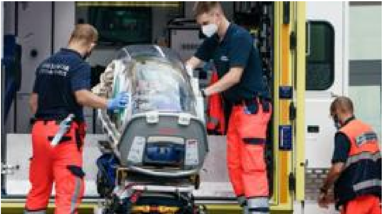
Navalny and Russia's arsenal of exotic poisons