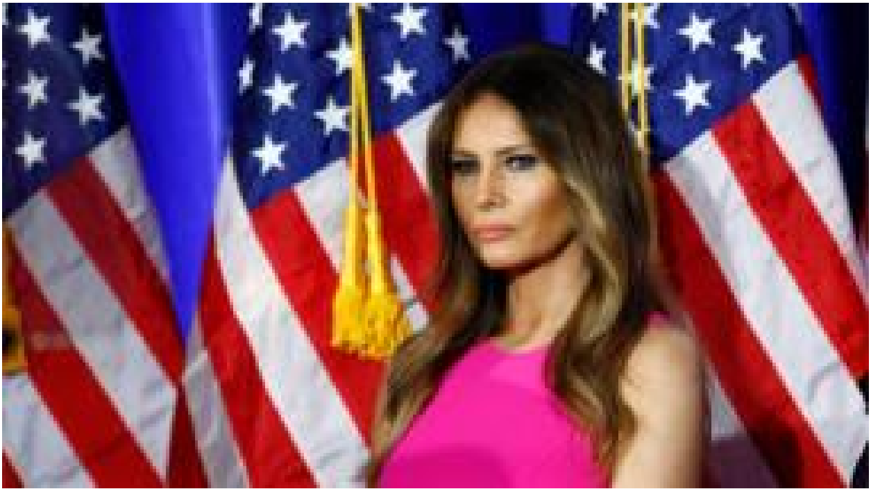
An unusual, traditional First Lady