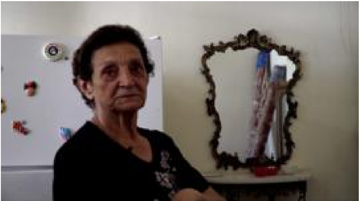
Beirut blast: 'I can't afford to fix my house'