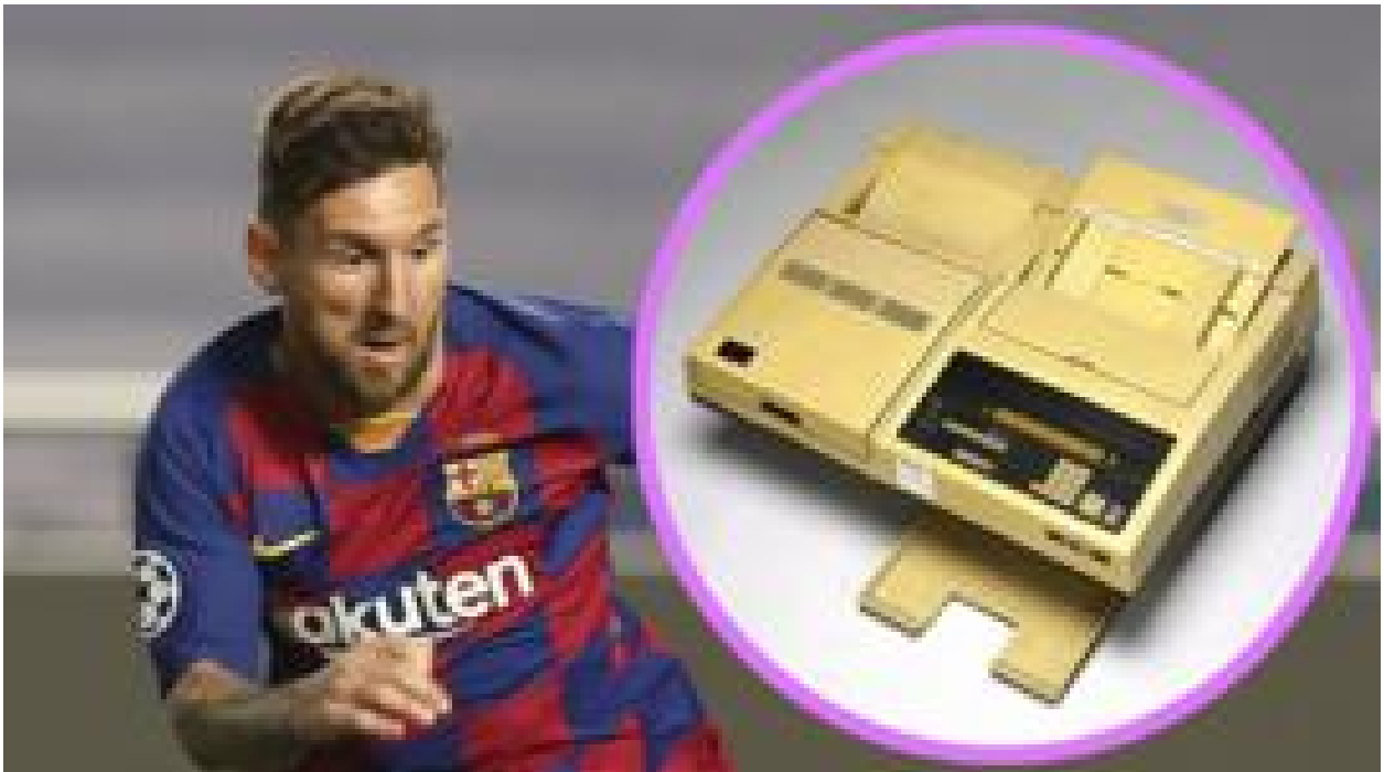
Did Messi really send his transfer request by fax?