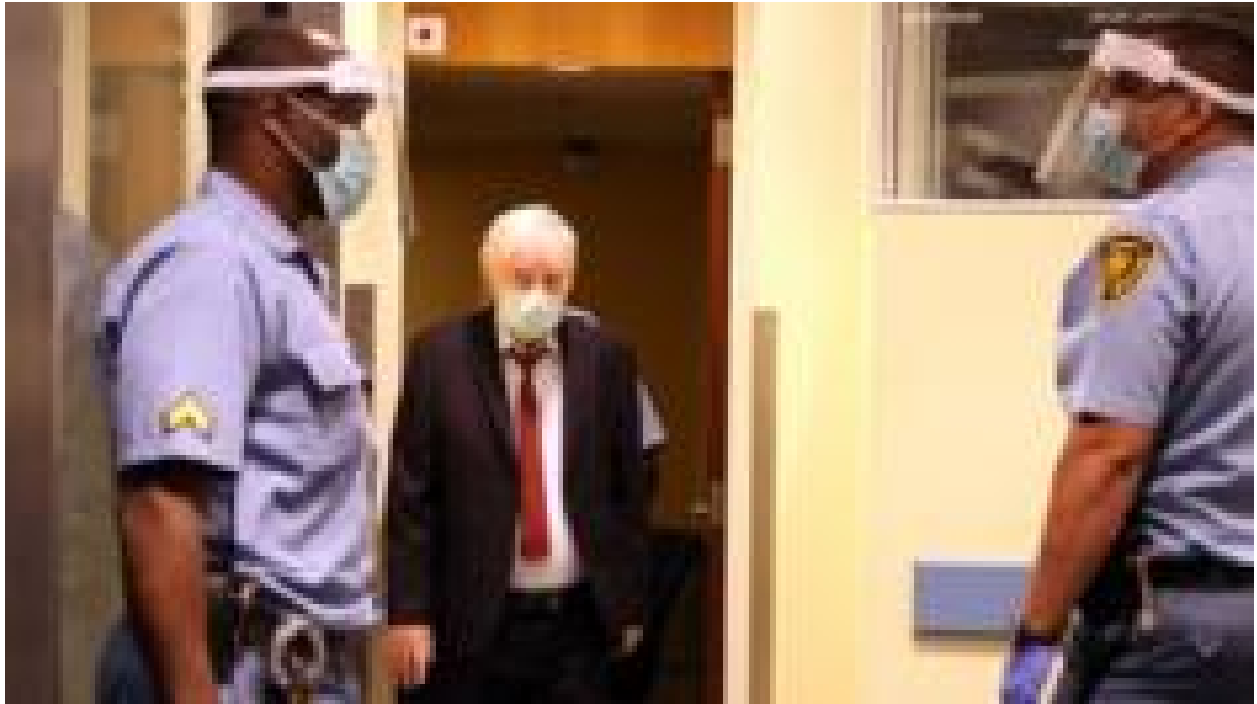
Mladic to address genocide appeal judges directly