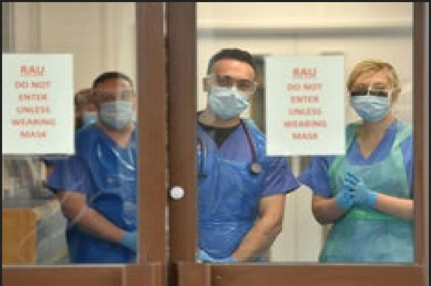
Lucrative coronavirus contracts handed to Tory ‘friends’ – Labour

“The deeper you delve into this Tory government’s Covid outsourcing, the more disturbing it gets,” she said.