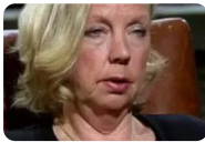
Last Nights Episode Left Viewers Speechless!