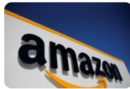
A £190 Investment Can Turn Into A Monthly Salary!