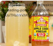
Brilliant Trick Melts Belly Fat Overnight (Do This Tonight!)