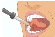
Doctors Speechless: CBD Oil Breakthrough Takes UK By Storm

( https://trends.revcontent.com/click.php?utm_medium=modal&utm_source=widget_121333&utm_campaign=forced-to-admit-that-vaccines-from-bill-gates-are-leading-polio-throughout-africa.html%3Ffbclid%3DhVwK3cHF7JWd0c855UjUthAhVxhK5KtE1nFmgNLQ7dAzL36O2RAQ )