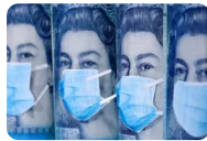
British Banks Won't Tell You About This System